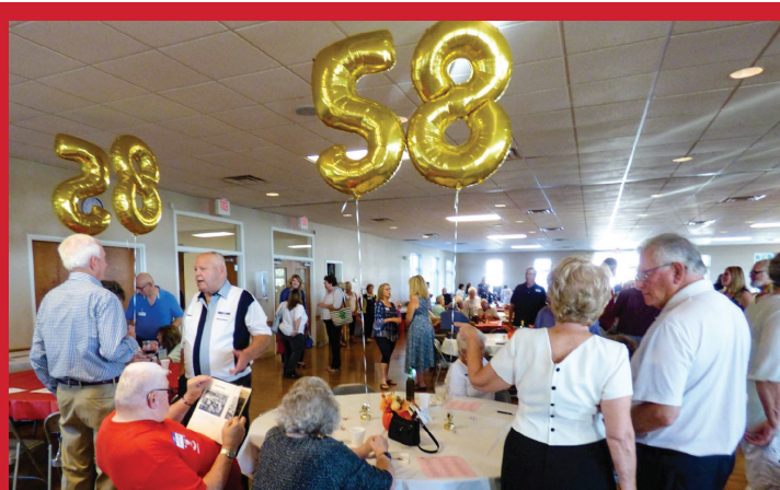
The Class of 1958 reminiscing after 60 years. Good friends and a wonderful memorabilia display.