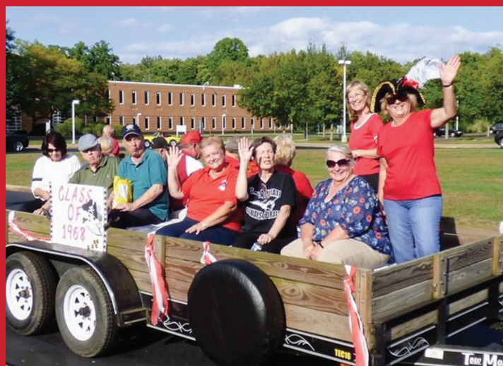
Some members of the Class of 1968 joined in the Perry Homecoming parade with a float of their own, kicking off a full weekend of festivities.